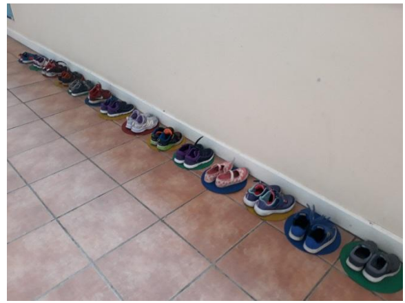
(Sitting on the floor to read our stories instead of at our desks) (Our shoes all lined up in the corridor)

Junior Infants even had a few special treats this half term; the opening of the garden with bouncing castles, a science show, bricks for kids and the PA Hallowe'en movie.