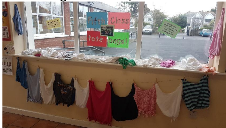
Tote bags made by 5 th class